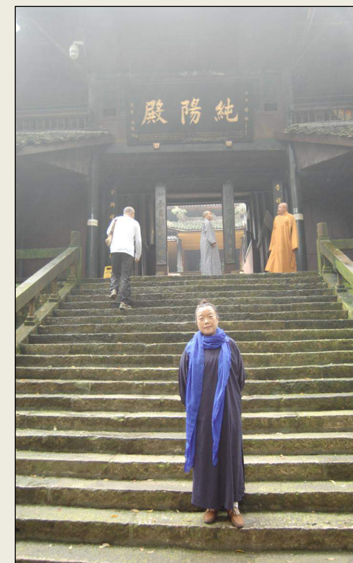
Chunyangdian on Emeishan – now a Buddhist temple