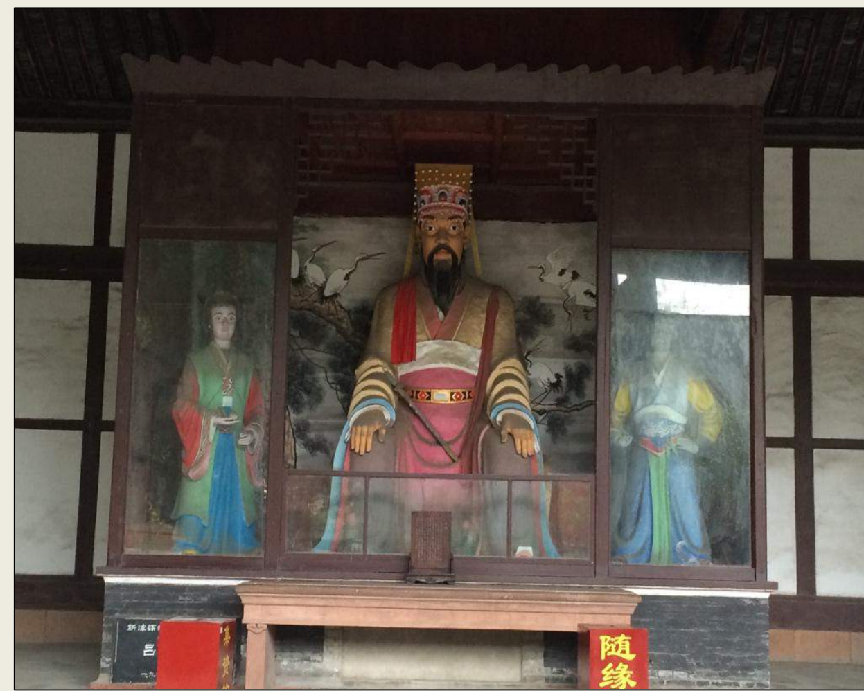
Statue of Lü Dongbin at the Chunyang guan in Xinjin

Several Qing dynasty temples dedicated to Lü Dongbin still remain in Sichuan