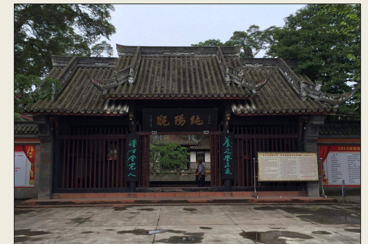
Chunyang guan in Xinjin – now a museum